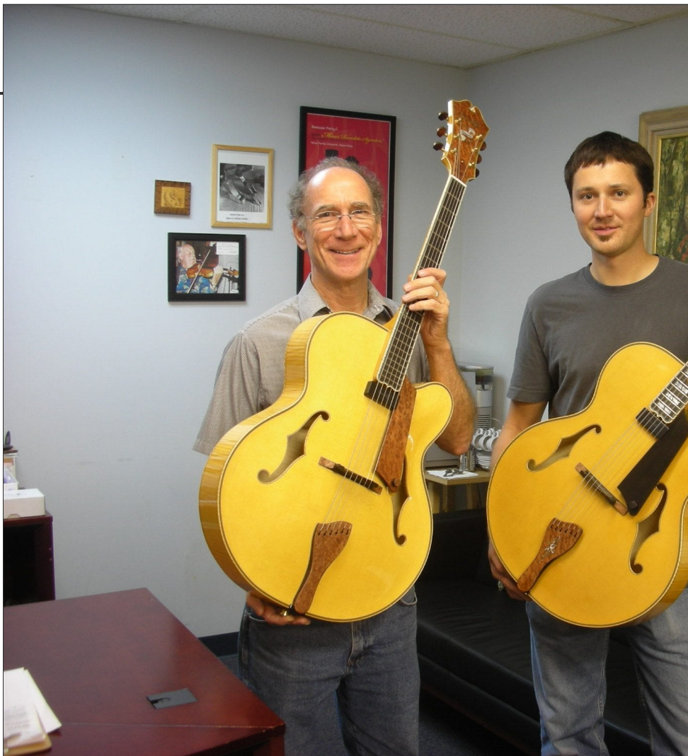
4 of 20