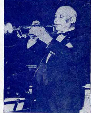
AS PLAYED BY THE COMPOSER HIMSELF